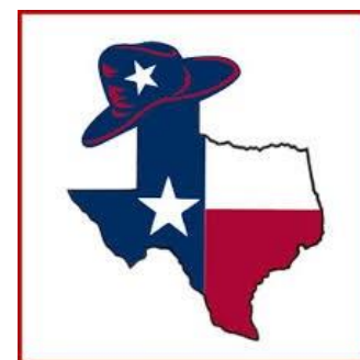
Red Texas Forum - Dallas