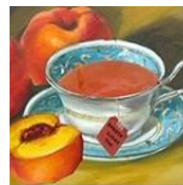
Fredericksburg TEA Party