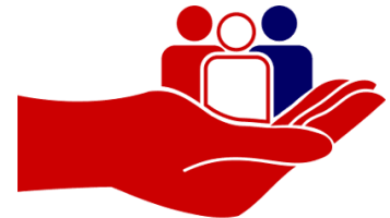
Minority Engagement Group